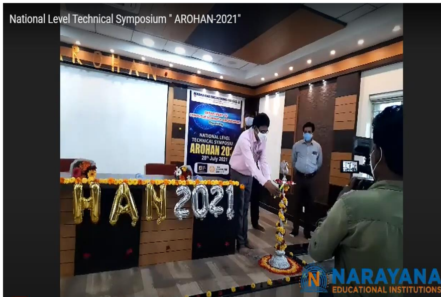
Dignitaries lighting the lamp