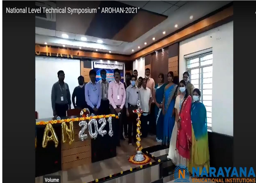
Event's organizing committee